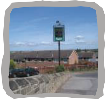
Walton Social Club Car Park (See Waymarker 1)