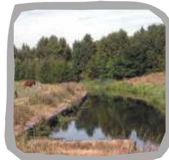
Barnsley Canal (See Waymarker 5)