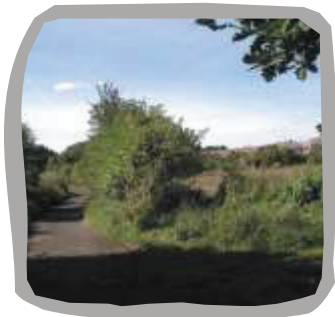
Dirt Road to Allotments (See Waymarker 2)