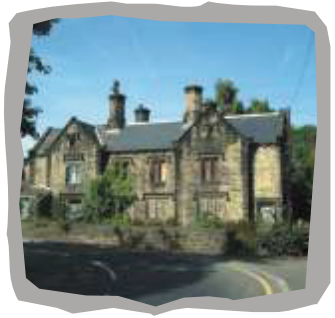
The Manor House (See Waymarker 3)